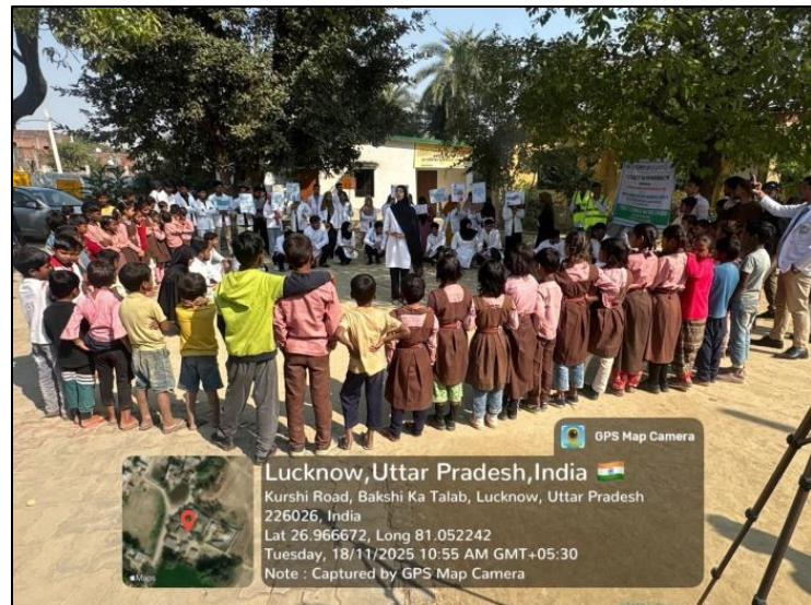
Street Play Campaign in School, Para Village, Lucknow.