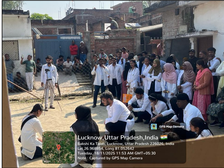
Students performing Street Play at Para Village, Lucknow.